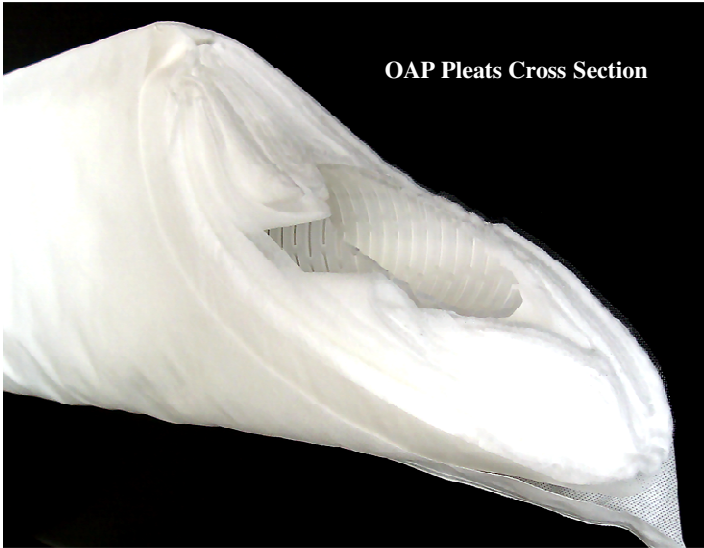
OAP Pleats Cross Section