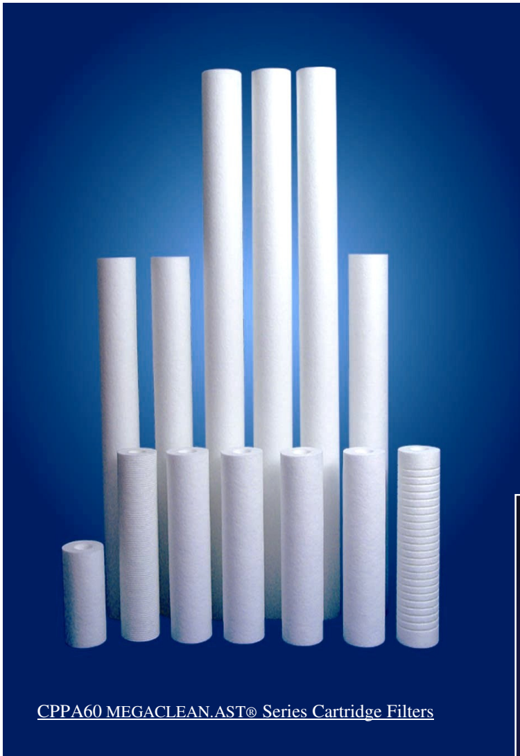
CPPA60 MEGACLEAN.AST® Series Cartridge Filters